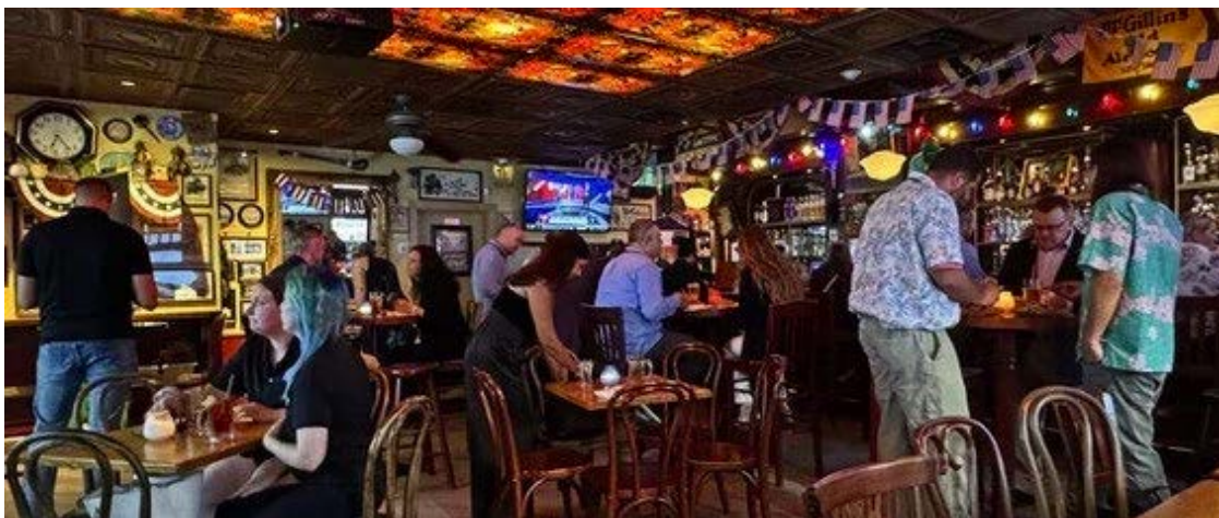
From top to bottom: ASTM D37 Members at June 2024 Committee Week, D37 Members enjoying the Networking Event at McGillin's.